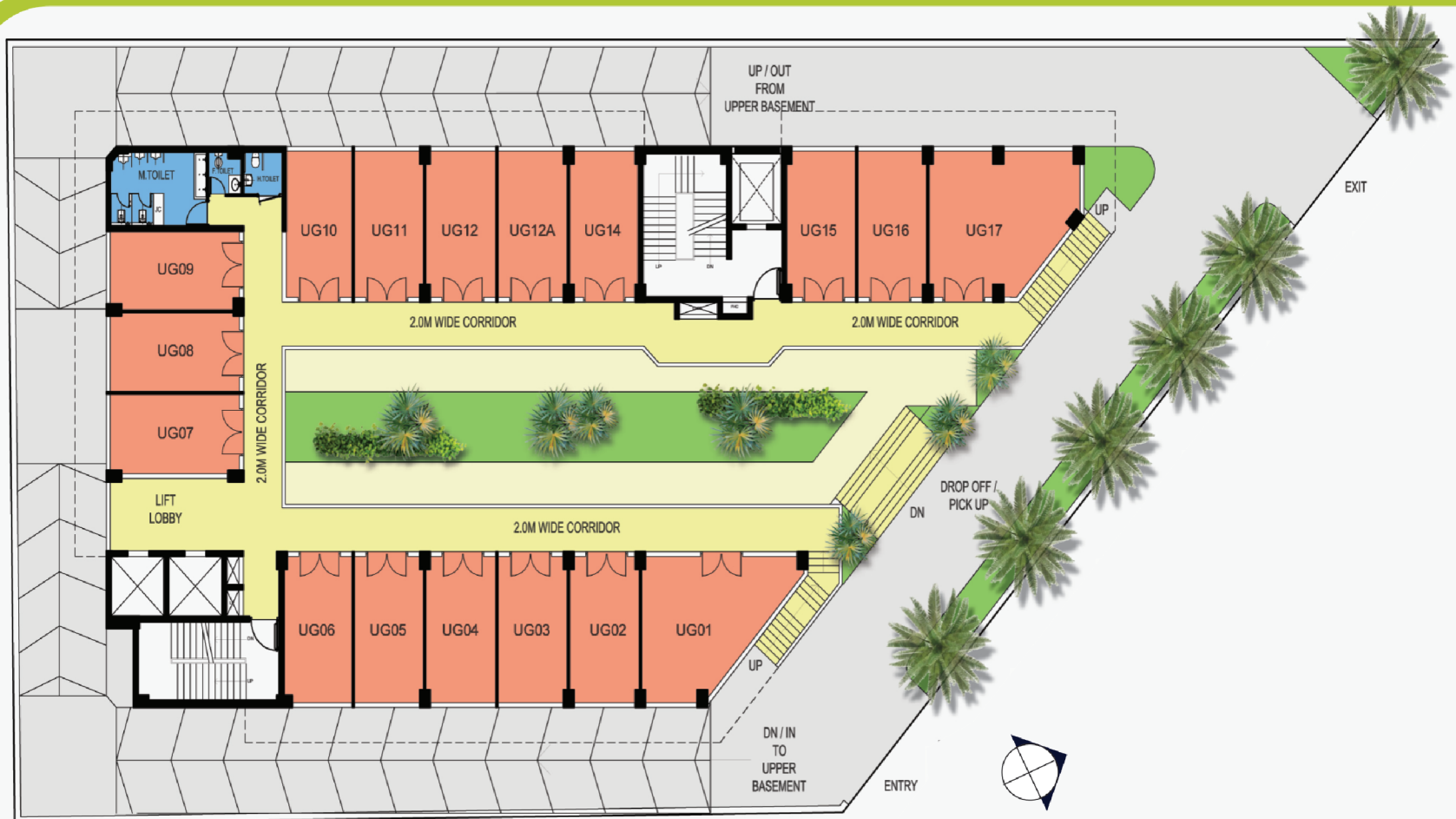
UNIWEST AERO HUB