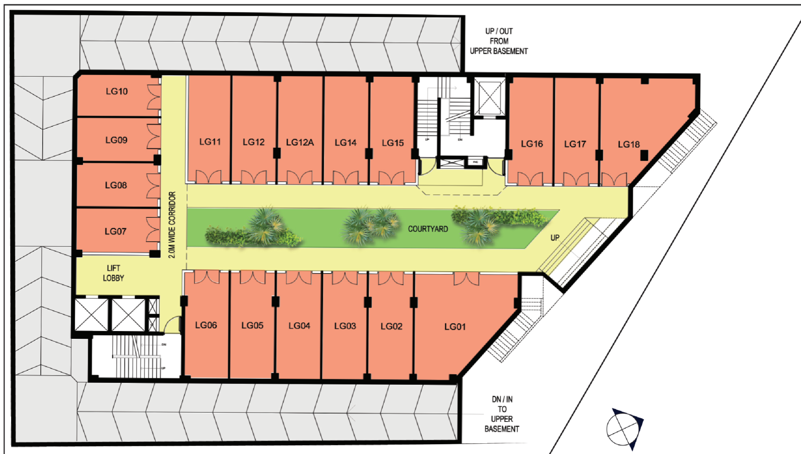
UNIWEST AERO HUB